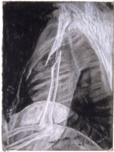
Arie A. Galles Sinister Drawing #2 15" x 11" 2000 Charcoal and White Conté